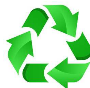
GUIDE TO CHOOSING THE INFILL

The product is 100% recyclable by our own company which, with obvious processing in ordinary authorization, will once again transform the granule at the end of its life into a new secondary raw material, regenerating it for new synthetic football fields.